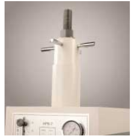
Precision Depth Stop