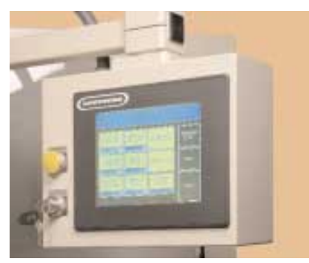
Touch Screen Control

With expertise that comes from having designed thousands of presses to meet a broad range of manufacturing requirements, our engineers will select the right modifications and options for your needs.